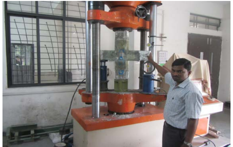
Fig.3 Test setup glass specimen.