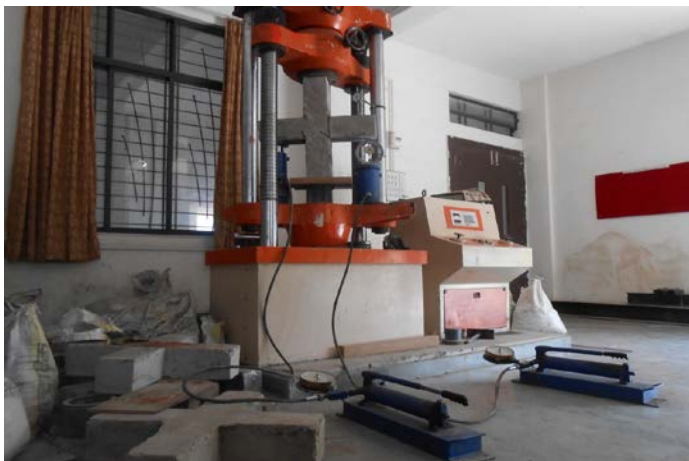
Fig.1 Test setup ordinary specimen.