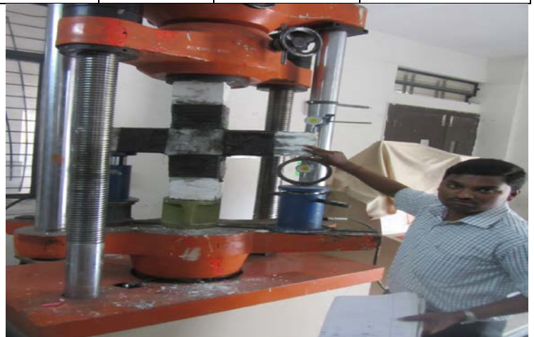
Fig.3 Test setup carbon specimen